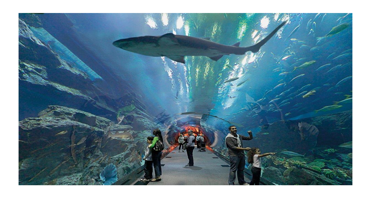
Dubai Mall Aquarium