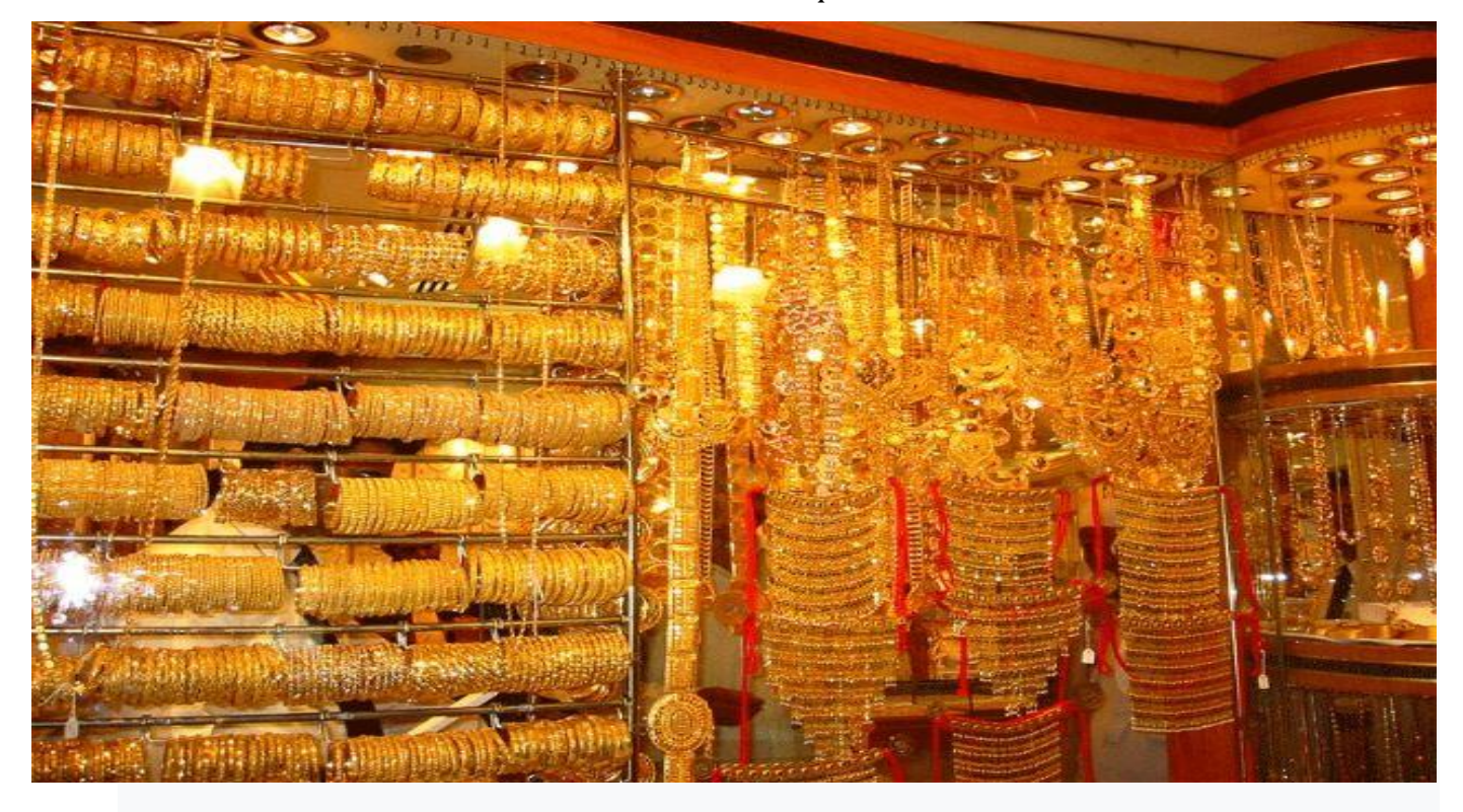
Gold village of Dubai