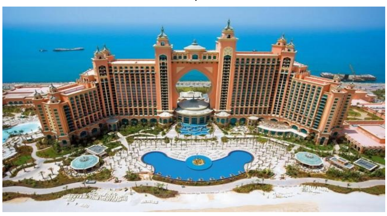
Atlantis Hotel at the tree top of THE PALM ISLAND