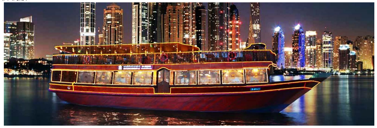
Dinner at Dubai Marina

Cruising through the waters in a leisurely style, you can see the mesmerizing skyscrapers of the latest Dubai Marina Residences. Dubai Marina Dhow Cruise Dinner is a special 2-hour dinner set in a traditional dhow. After departing from Dubai Marina, the cruise will move to Dubai Marina Mall, a host of international five-star hotels known for their influential architecture. Then you will see the popular Palm Jumeirah along with the attractive Atlantis Hotel and well as the well-known and prestigious Burj Al Arab.