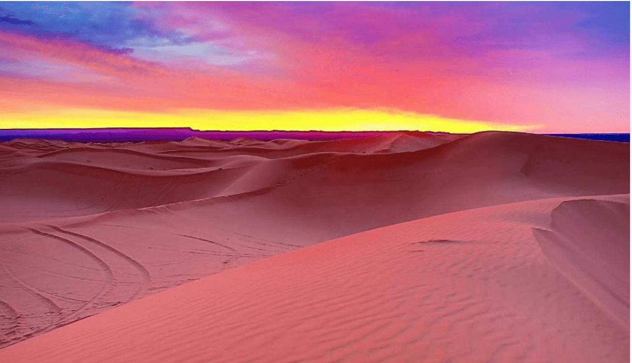
DAY 5 – DEPARTURE DAY

Drop off to DUBAI INTERNATIONAL AIRPORT At the end of the Desert event driving to Dubai International airport for a 02:30 flight to Dar Es Salaam arriving on 08:50 to Dar