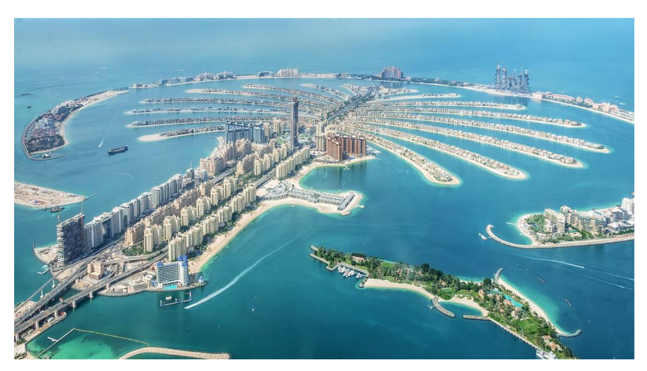
THE PALM JUMEIRAH